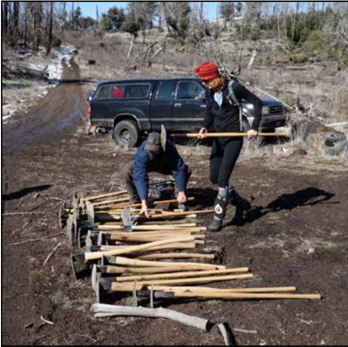
Unloading the tools for the day's trail work

SBMTV worked with California State Parks Ranger Tyson Burke to host volunteers from multiple local organizations and re-open a section of the “Trespass Trail” in Gaviota Coast State Park.