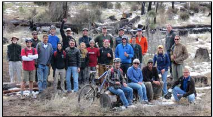
Volunteer crew for Santa Cruz/Little Pine Trail

Approximately $900,000 in kind contributed from 1988 - 2012