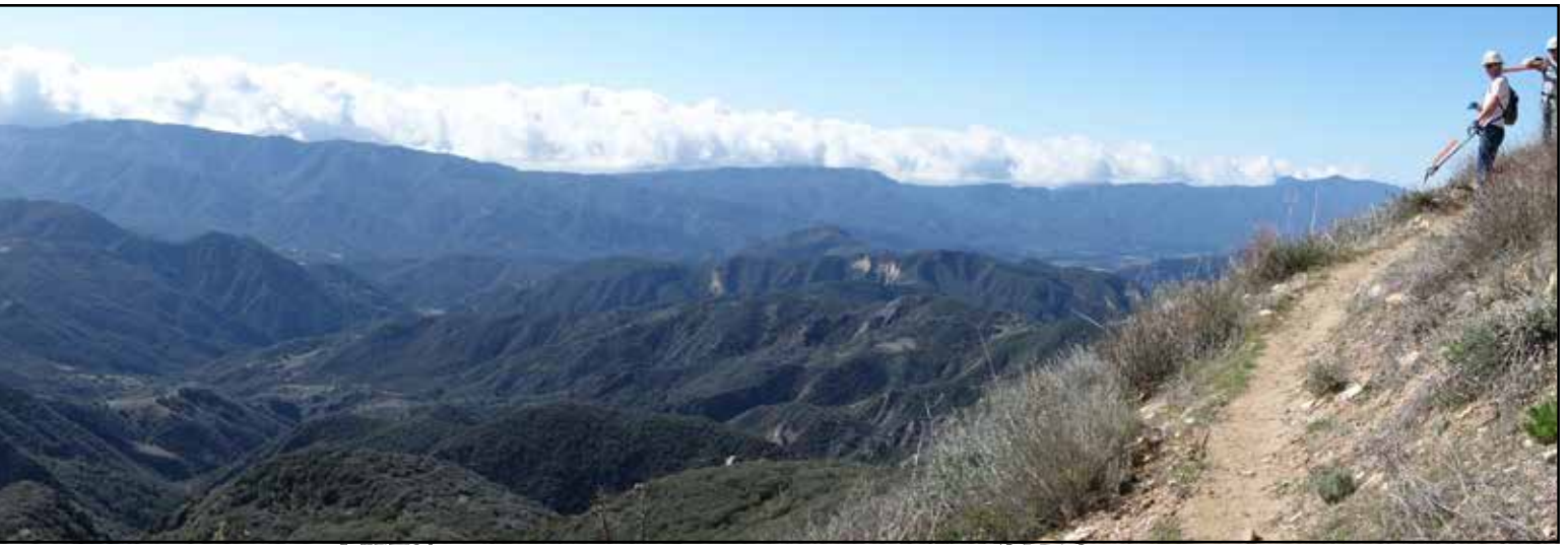
Santa Cruz/Little Pine panoramas above and on cover (photos by Mitch Sereda)